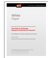
5 Steps to Achieving Business Continuity for Everyone