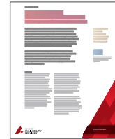
Assurance CM Solution Brief